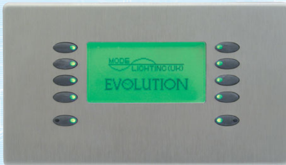
EVO-LCD-55-BLK with EVO-L-BSS-55