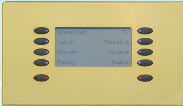
EVO-LCD-55-BLK with EVO-L-PBR-55