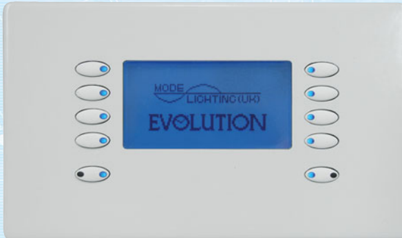
EVO-LCD-55-WHI with EVO-L-WHI-55