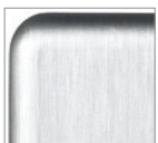
BSS – Brushed Stainless Steel