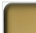
PBR – Polished Brass