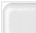
WHI – White