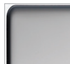
POC – Polished Chrome

Installation should be in accordance with the relevant National Wiring Regulations and other applicable Regulations. Compliance to EC EMC and Low Voltage Directives may be invalidated if not used or installed according to the published specification.